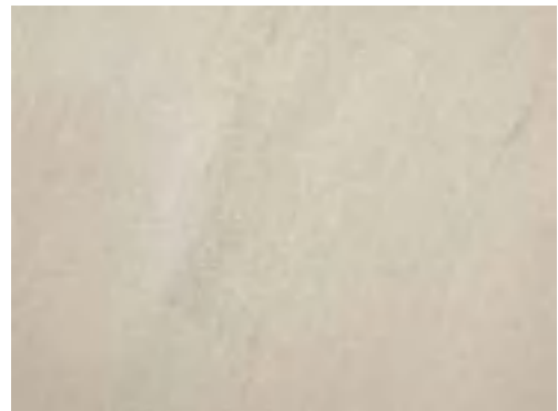
A matt grey is left on annealed mill products following descaling and pickling. Mechanical scale loosening roughens the surface.