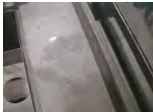
Patchy, uneven pickled surfaces can result if surfaces are not clean before the acid treatment.

If stainless parts are contaminated with grease or oil, then a cleaning operation prior to acid treatment should be carried out.