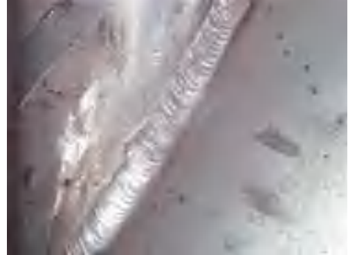
Detail of the welded area after chemical surface treatment: the purpose of this treatment is not to remove the weld seam itself, but the welding tint that accompanies it.

Heat tint is often seen in heat affected areas of welded stainless steel fabrications, even where good gas shielding practice has been used (other weld parameters such as welding speed can affect the degree of heat tint colour formed around the weld bead).