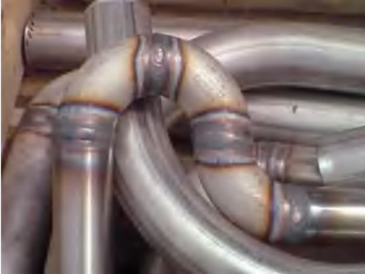
Light scaling left on weld caps and heat tint on the surrounding parent tube surfaces can usually be removed by acid pickling.