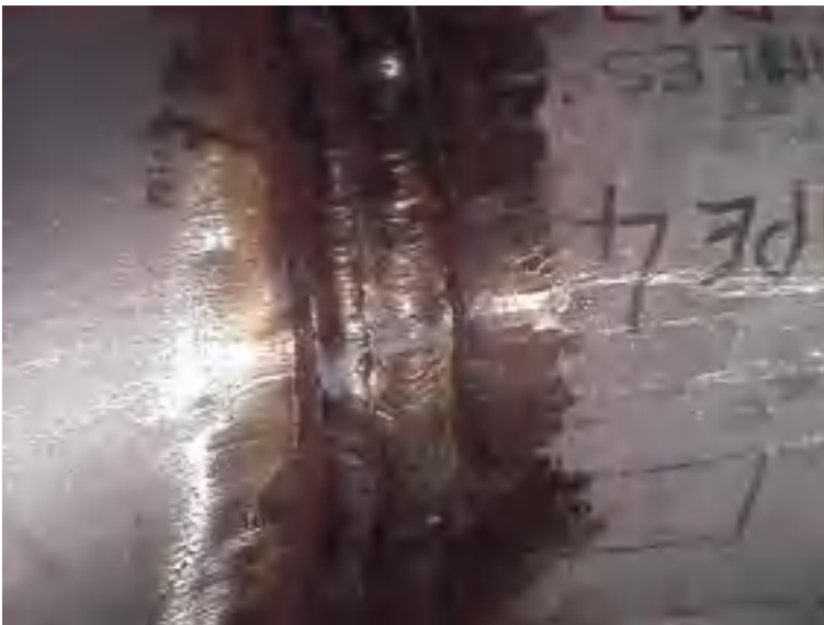
Welded stainless part in the "as welded" condition: the oxide scale is likely to give way to corrosion if not properly removed.

As heat tints are formed on the surface of stainless steel chromium is drawn to the surface of the steel, as chromium oxidises more readily than the iron in the steel. This leaves a layer at and just below the surface with a lower chromium level than in the bulk of the steel, and so a surface with reduced corrosion resistance.