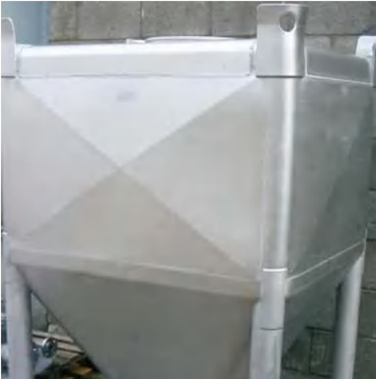
After cleaning, pickling and passivation treatments a sound and consistent finish is produced. This looks good and gives a surface with optimum corrosion resistance for the particular stainless steel grade used.

Your nearest national stainless steel development association should be able to advise on companies providing specialist assistance on developing surface finish standards for specific projects.