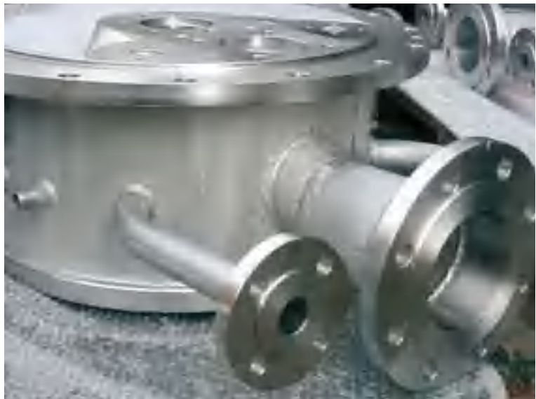
Heat tint left in welded areas of a complex fabrication can be effectively removed by pickling by immersion pickling. The corrosion resistance of the whole fabrication has been restored by pickling.