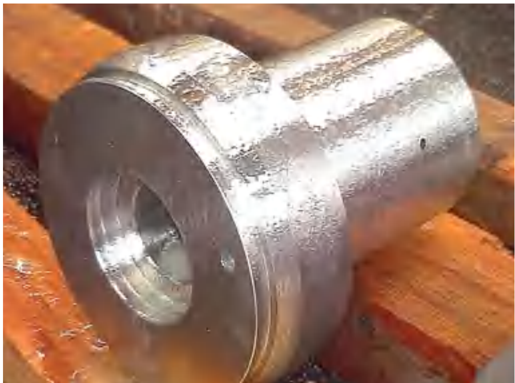
Small stainless steel parts can be effectively pickled with brush-on gel.

Your nearest national stainless steel development association should be able to advise on pickling product and pickling service suppliers locally available.